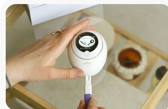
Step 2 Insert the wand into the Mira Analyzer.