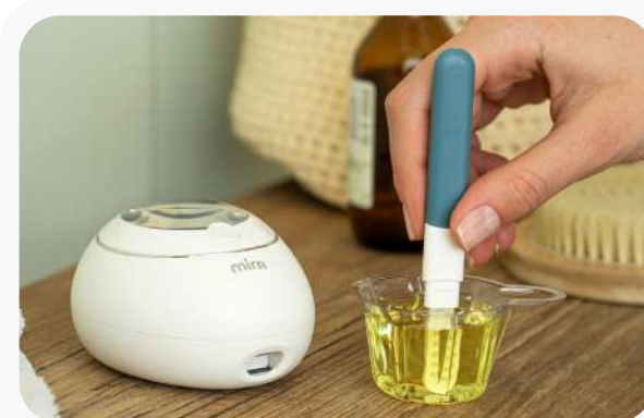
Step 1 Dip the test wand into urine for 10-20 seconds.

The Mira App's advanced algorithm provides accurate and personalized information about your cycle, hormone levels, and fertile window.